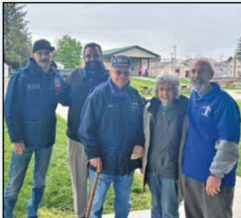
Celebrating Arbor Day in Highspire.