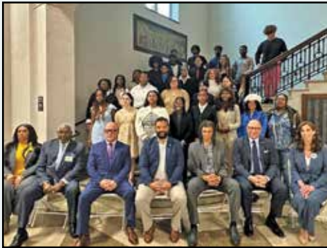
With the finalists of the ACTSO writing competition.