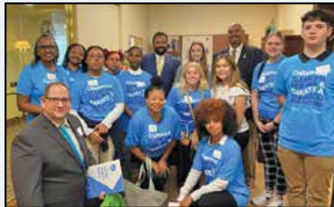
Supporting Halifax High School Tobacco Resistance Unit's cause at the Capitol.