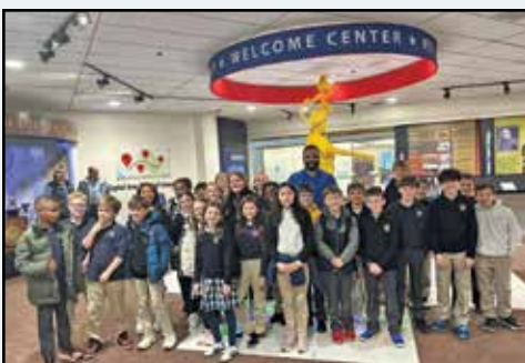
Hosting 4th graders from Ancillae Assumpta Academy for an engaging tour of the State House!