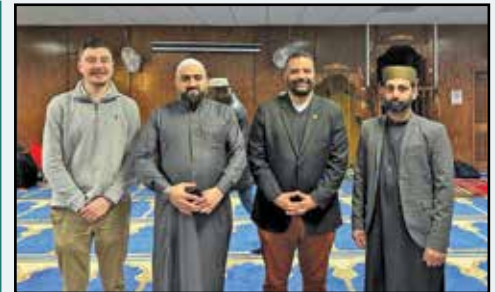
Grateful for the invite to the Ramadan Iftar Dinner at Masjid Al Sabereen!