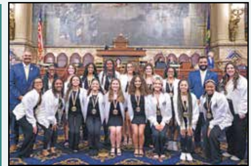
Congratulations to the Central Dauphin East High School cheer team for claiming the 2024 National Champions title!