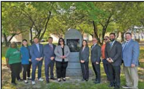
Recognizing the people who keep PA moving at our Workers Memorial event.