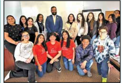
Spending time with some future leaders at an LHAC Youth Meeting.