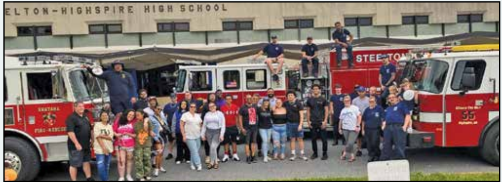
With Steelton-Highspire Fire Co. at the Roller Pride procession to celebrate Steelton's graduating class of 2024.