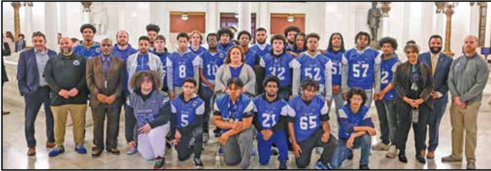
I welcomed the Steelton-Highspire football team back to the Capitol after winning the PIAA 1A State Championships for the second year in a row.